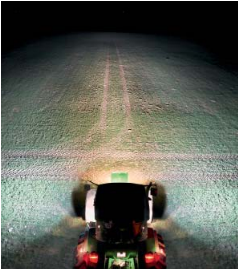
Upgrade option 2: 2 x halogen worklights / 4 x LED worklights