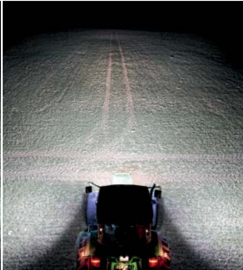
Upgrade option 3: The future 6 x LED worklights