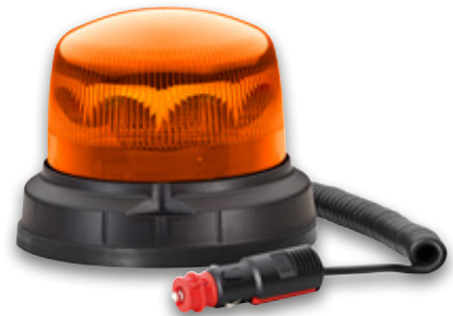
Magnetic attachment 2XD 013 979-021