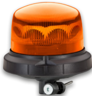
Flexible pipe socket 2XD 013 979-011