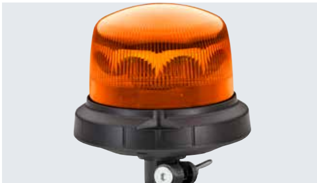
Beacon default position

The flexible foot of the RotaLED Compact FL softens hits and impacts thanks to its special design. The lamp will always return to its original position; this significantly reduces the risk of damage. RotaLED Compact is therefore fully protected, e.g. against suspended branches of any size.