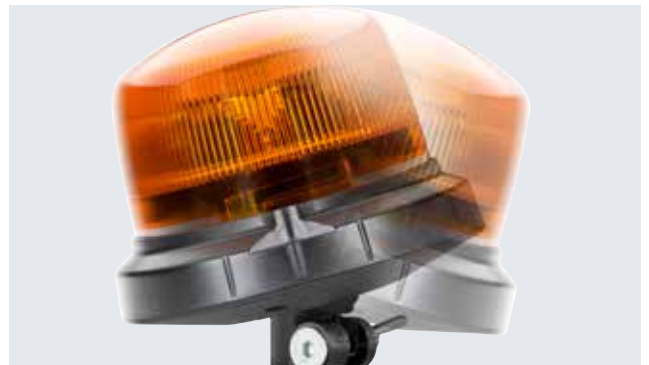
If the beacon inclines by up to 30°, it returns to default position.