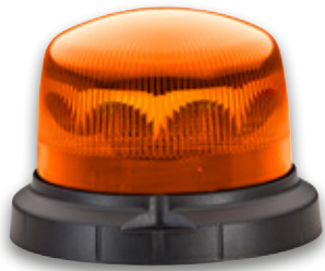
Fixed attachment 2XD 013 979-001

Whether using magnetic attachment for fixed installation or flexible pipe sockets: RotaLED Compact is suitable for many application areas thanks to its many assembly options. No matter, which version you decide on, RotaLED Compact convinces thanks to its noticeable LED flash function and the absence of movable parts, providing maximum reliability and a strong warning effect.