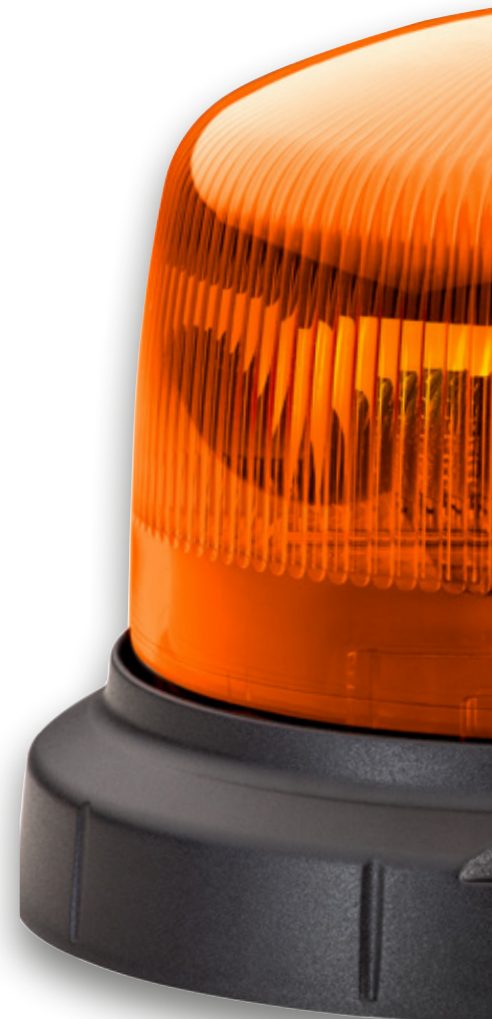
Display in original dimensions