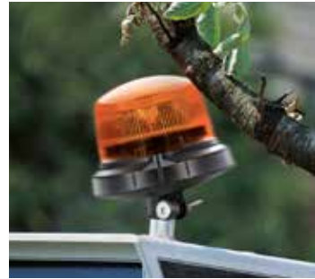
1:1 exchange: Rotaflex against RotaLED Compact